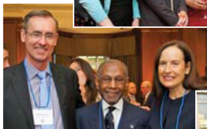
Toronto (May 15)