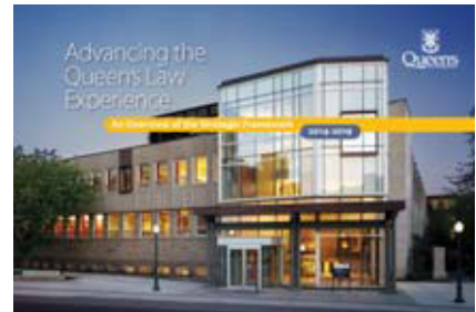
The 2014–2019 Strategic Framework summary document is included with this issue of Queen's Law Reports.