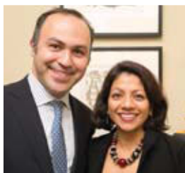
New York City (Jan. 22)