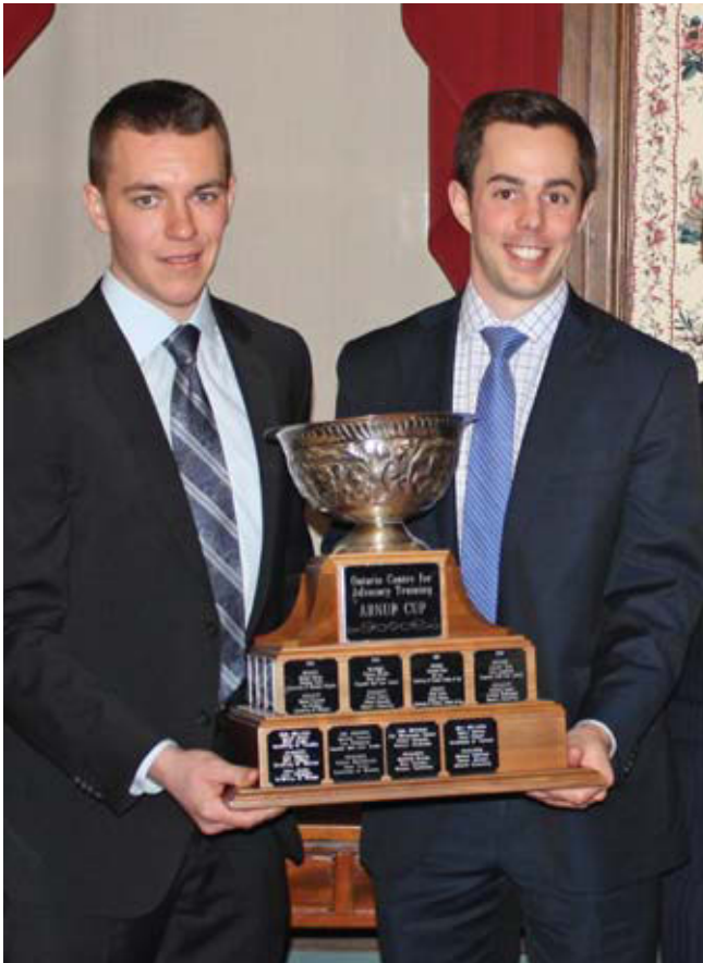
THE ADVOCATES SOCIETY