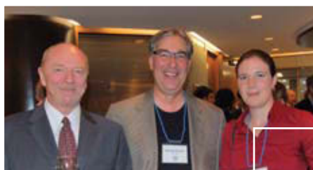
Ottawa (May 13)