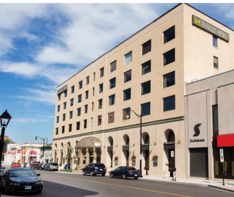
LaSalle Mews, once the site of the historic LaSalle Hotel, viewed from Bagot Street

to improve the student workroom after her death in 2008, will move with us," she says. So will the plaque recognizing the Law'81 Clinical Programs Fund.