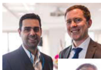
Calgary (May 8)