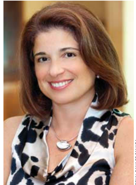
ROYAL BANK OF CANADA