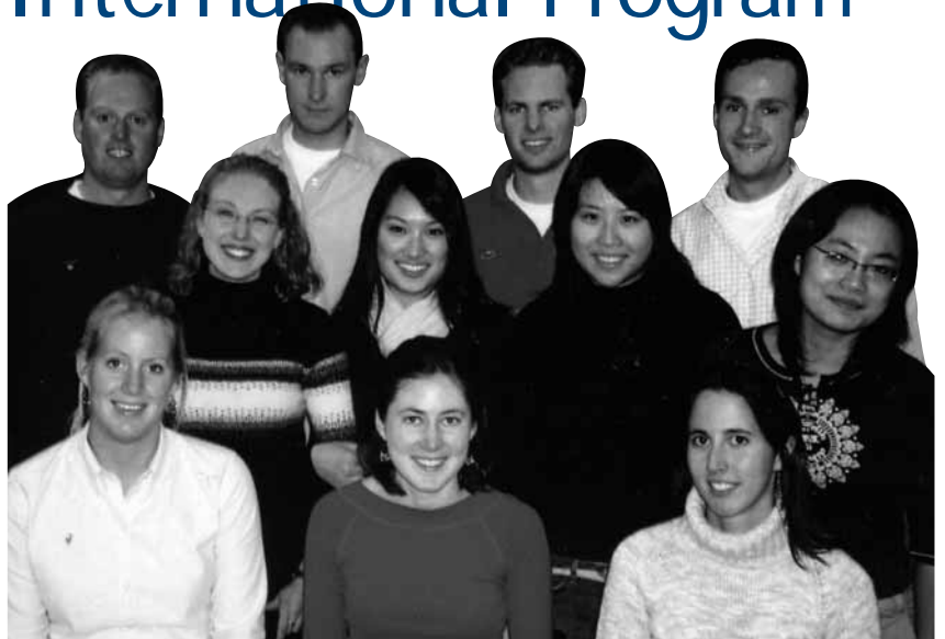
These students studied at Queen's Law during the Fall 2004 semester.