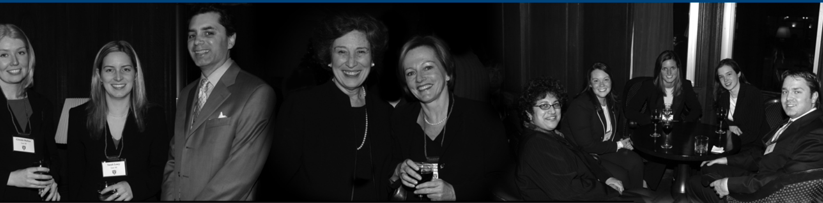
Celebrate Queen's Law ~ January 20, 2005