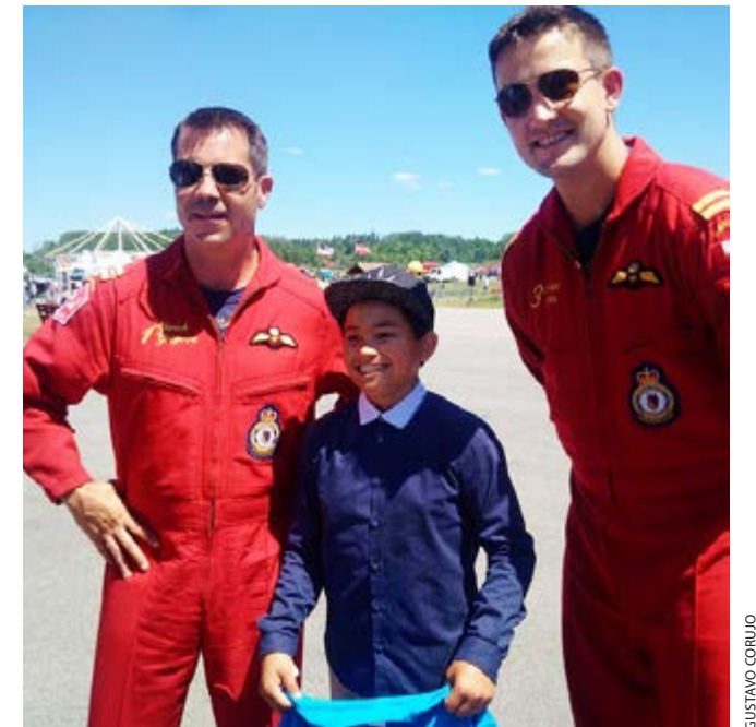
A First Nations boy meets Snowbird pilots.

“It’s so important for young people from all over the country to meet First Nations kids and realize that Aboriginal youth are just kids like them who want to succeed and be the best that they can be despite challenges.”