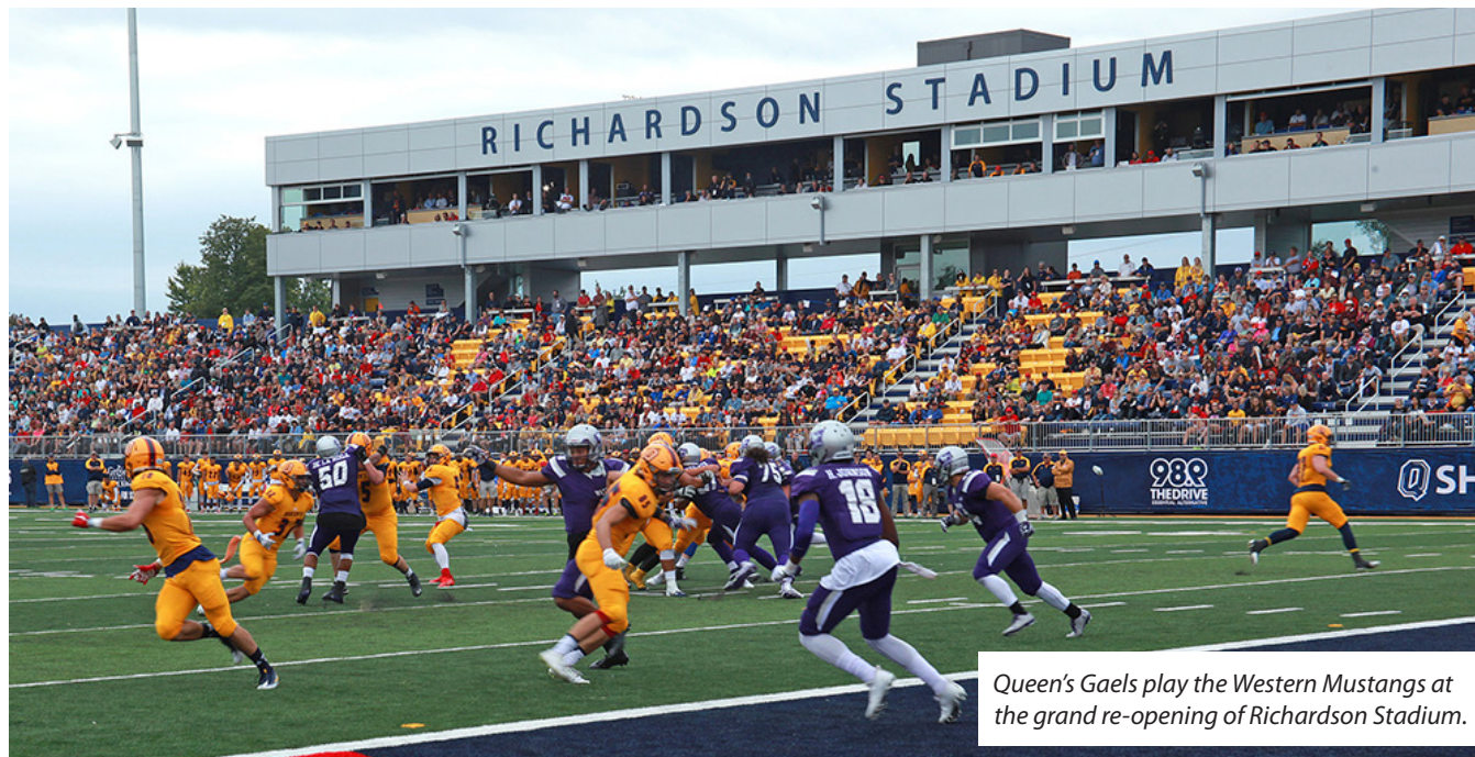
Queen's Gaels play the Western Mustangs at the grand re-opening of Richardson Stadium.