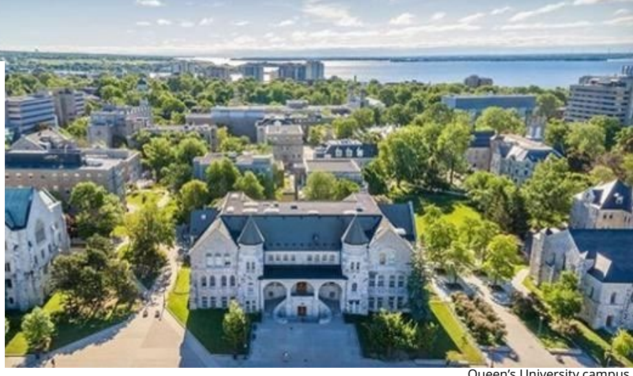
Queen's University campus

Incoming international exchange students live off-campus in nearby privately owned housing, usually within a 15-minute walk to campus. We recommend students securue adequate accommodation in advance, as furnished housing is in high demand in the fall. It is also recommended that students take advantage of the housing resources offered by QUIC to avoid rental housing scams.